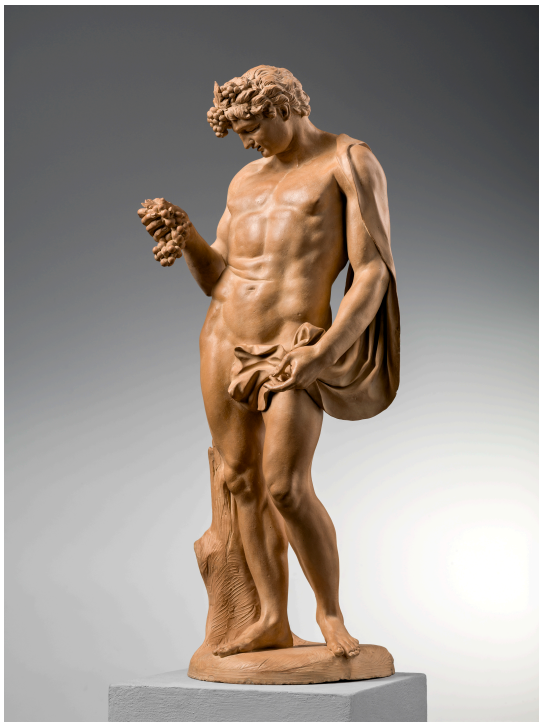
Giuseppe Maria Mazza, (Bologna, 1653-1741) Bacchus - Terracotta height 64 cm / height 25 1/4 in