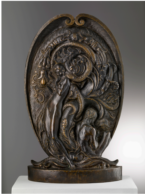
Antonio Maraini (Rome 1886–Florence, 1963) Eve, Monza, 1923 - Bronze 76 x 46 x 12 cm. / 29 7/8 x 18 1/8 x 4 3/4 in

The bronze represents Adam and Eve Tempted by the Snake and reflects Maraini's detailed study of 15th- and 16th-century Tuscan artists: Eve's elongated and arched body is a cultured allusion to the sophisticated Mannerism running from Parmigianino to Cellini.